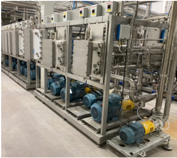
SNS pump units on starch washing