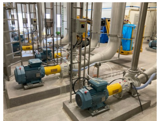
A-LM pump units on fiber separation

Reduced air in the system also enhances the efficiency of other process devices, and the use of expensive antifoam agents is greatly minimized.