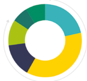
Figure 2: Depending on mill type and amount, the greatest absolute additional potential is on-site at integrated chemical pulp and paper/board mills