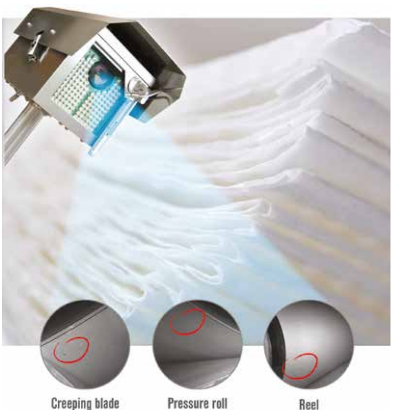
Figure 3: The Converting Control System (CCS) helps to reduce web breaks.

It is important that hundreds of features are calculated for each defect recognized by the inspection system.